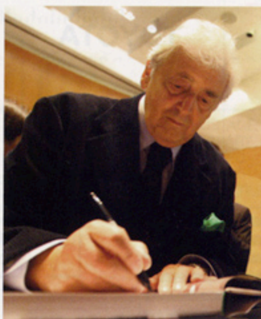
From left: Photos from Harry Benson's America graced the boutique's window displays; Harry Benson autographs one of his books.