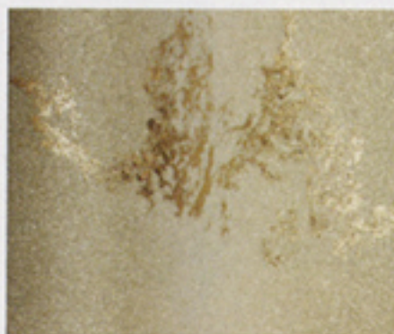
Beadazzled Leaf™ wallcovering

Two photos in the January issue's "Design Datebook" were misidentified. The correct information appears below.